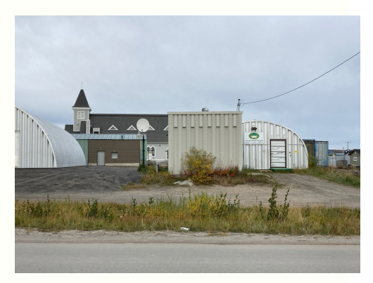
PICTURES FROM NATHAN'S PRELIMINARY FIELDWORK ON FOOD GOVERNANCE IN INUIT NUNANGAT: A COMMUNITY FREEZER, COMMUNITY GREENHOUSE, AND HYDROPONIC GROWING CONTAINER IN KUUJJUAQ, NUNAVIK (NORTHERN QUEBEC).